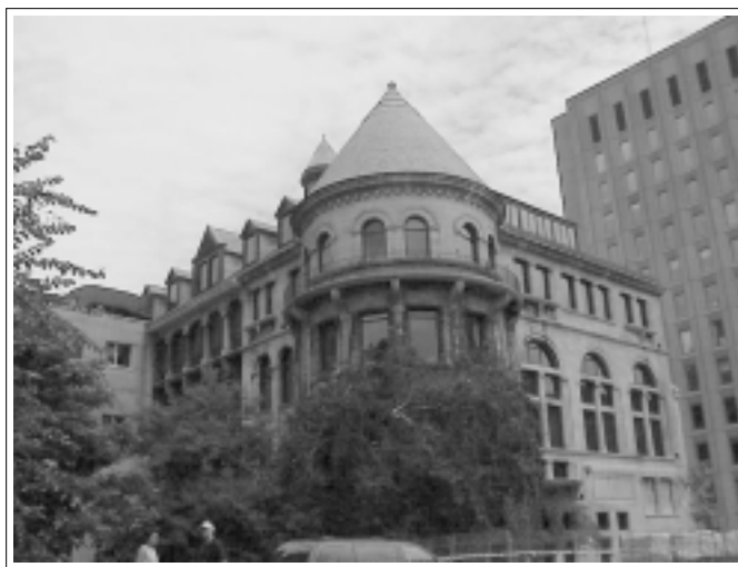
Figure 3. Physikalisches Institut Building of Friedrichs Universität. Ernst Dorn conducted his “radium emanation” studies on the steps of the basement of this building.

In a private note to Rutherford, Mme. Curie suggested the phenomenon might be a form of phosphorescence (31). This “radioactive energy” was baffling; vague descriptions were offered, for example, that they were “centers of force attached to mol-