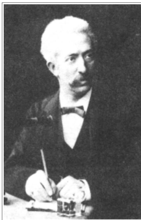
Figure 1. Friedrich Ernst Dorn (1848-1916), Geheimer Regierungsrat Professor of Friedrichs Universität, Halle (Saale). (Portrait at the University of Halle;).