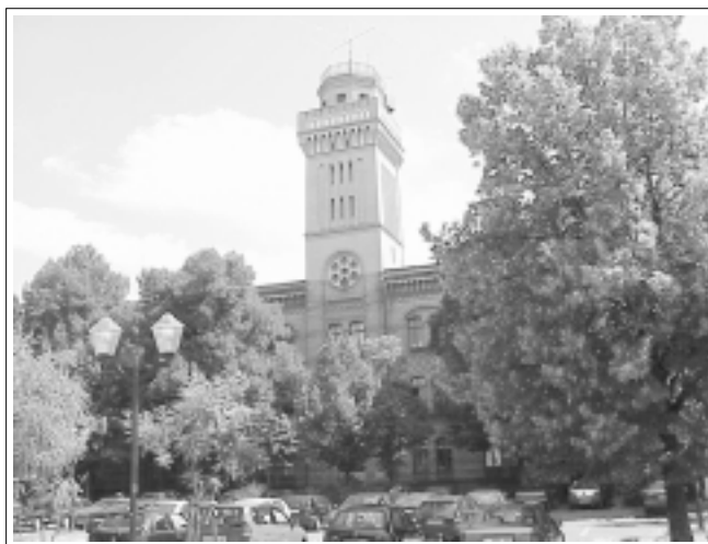
Figure 4. The Macdonald Physics Building, where Ernest Rutherford performed his work. The building is now used as a library.

[Ramsay and Rutherford had discovered argon, and Ramsay had discovered the inert gases neon, krypton, and xenon during the previous decade] (37). All this research was done on the emanation from thorium. Rutherford quickly followed up with a similar